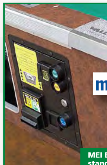
MEI Bill Acceptor standard on every table