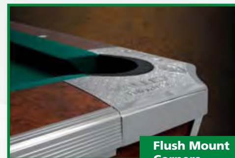
Flush Mount Corners