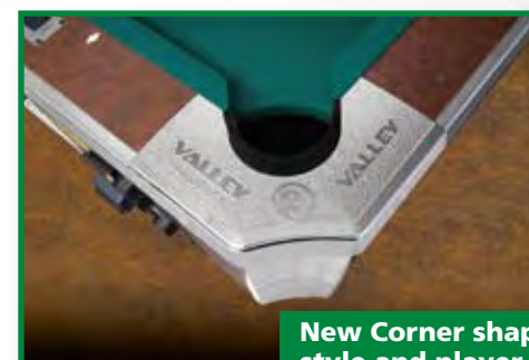
New Corner shape for style and player comfort